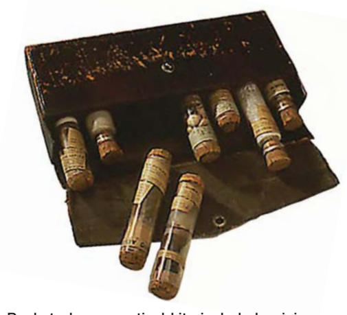
Pocket pharmaceutical kits included quinine to treat the chills and fever of malaria, calomel to treat constipation, and tannic acid to treat hemorrhages, diarrhea, dysentery and cholera.

In the spirit of those farsighted and determined Civil War medical logisticians, DLA has made significant, tangible and sustained contributions to medical material readiness operations supporting U.S. warfighters.