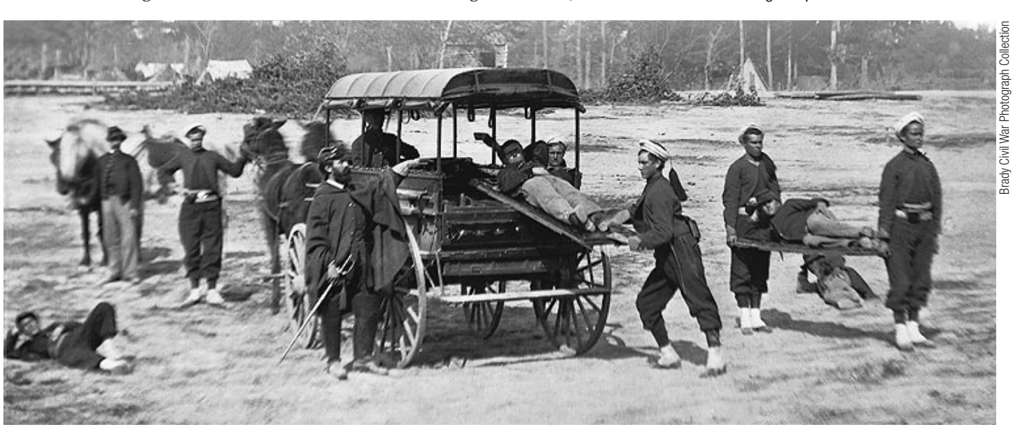
Civil War Soldiers perform an ambulance drill in the field with the newly organized Medical Ambulance Corps soon after the Battle of Antietam in 1862.

New York City remained the principal medical supply center, and additional depots were established to be closer and facilitate supply to geographical armies and smaller units. The U.S. surgeon general also established three official laboratories in Astoria, New York, Philadelphia, and St. Louis to increase the production of consistently high-quality medicines and permit easier transport to depots, according to "A Civil War Medic's Knapsack," an article by Chuck Franson in the Summer 2013 issue of AMEDD Historian. Other initiatives included increasing the authorized number of wagons to carry supplies, more and better ambulances, using tents as hospitals, establishing the position of medical