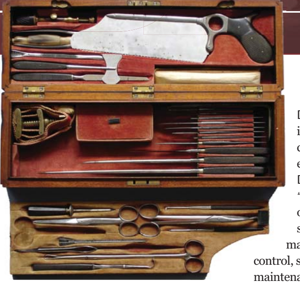
U.S. Army surgeons were issued surgical kits such as this one. The kit contained the instruments needed to perform a variety of surgical procedures.

storekeeper, and increasing the use of contractors in medicine production.